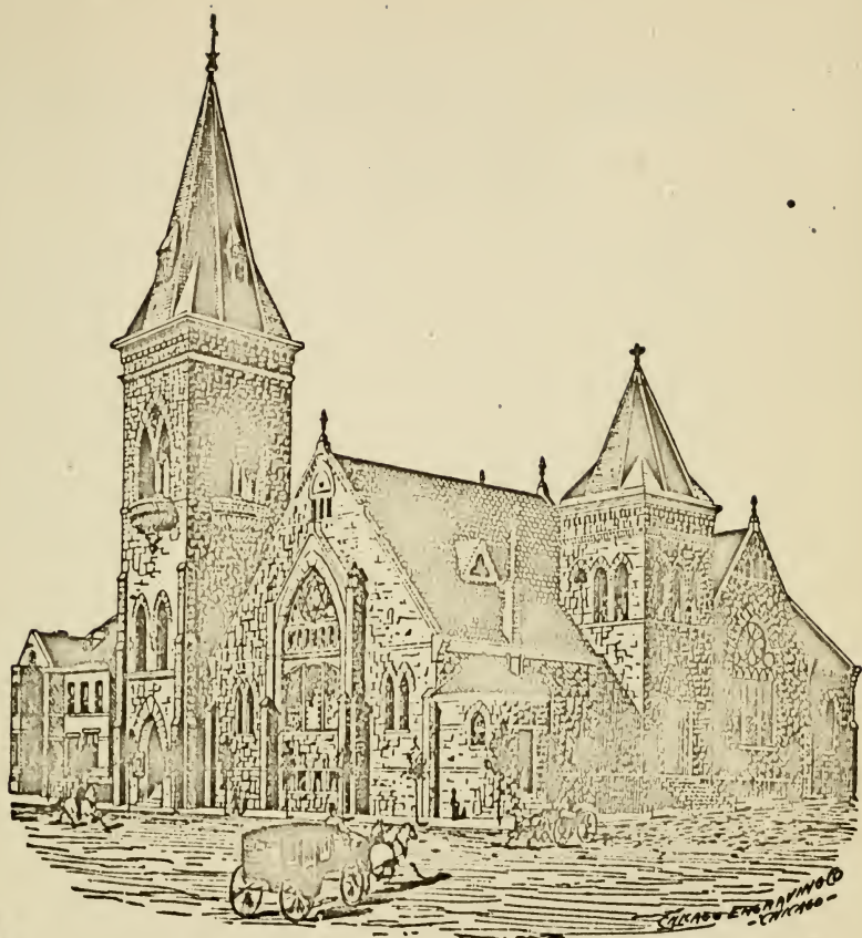
Parker Memorial Baptist Church, Anniston, Alabama.